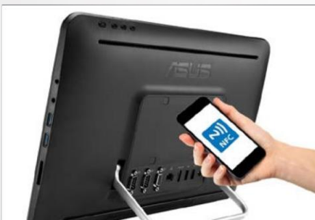
Optional NFC module for convenient data