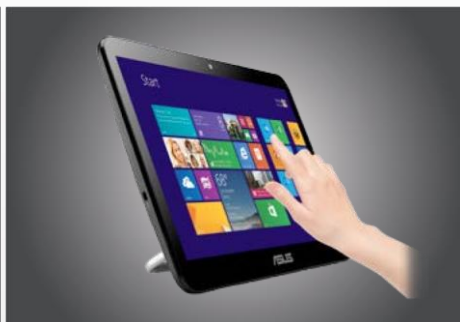
Capacitive 10-point Touch Technology