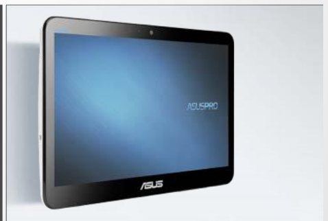
VESA wall-mount for flexible placement